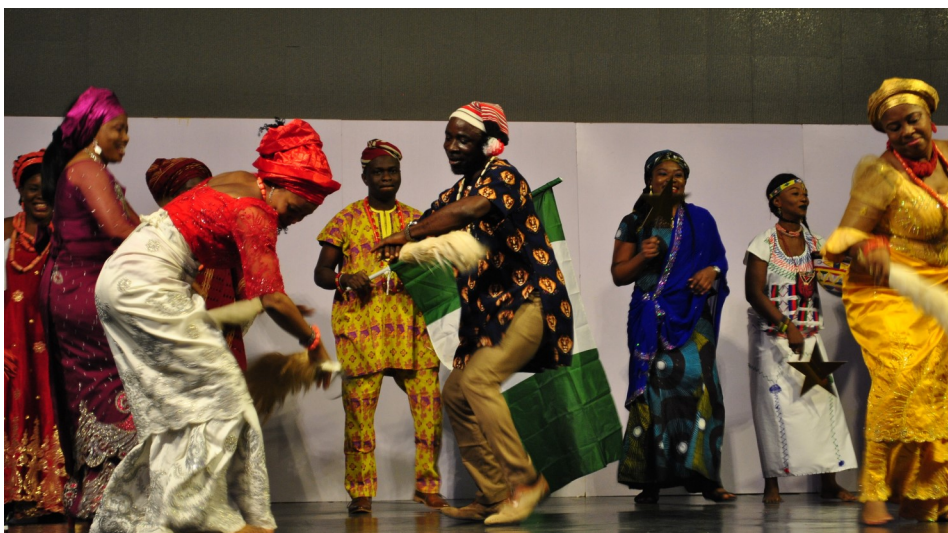
SLMTA Nigeria Song and Dance, ASLM2018, Abuja, Nigeria